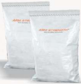
PP WOVEN SACK BAG