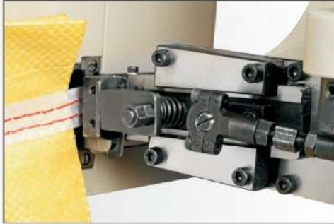
ELECTRO THREAD/TAPE CUTTER