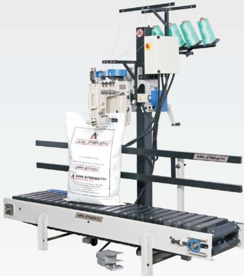
BAG CLOSER SEWING MACHINE WITH INFEED & FOLDING SYSTEM